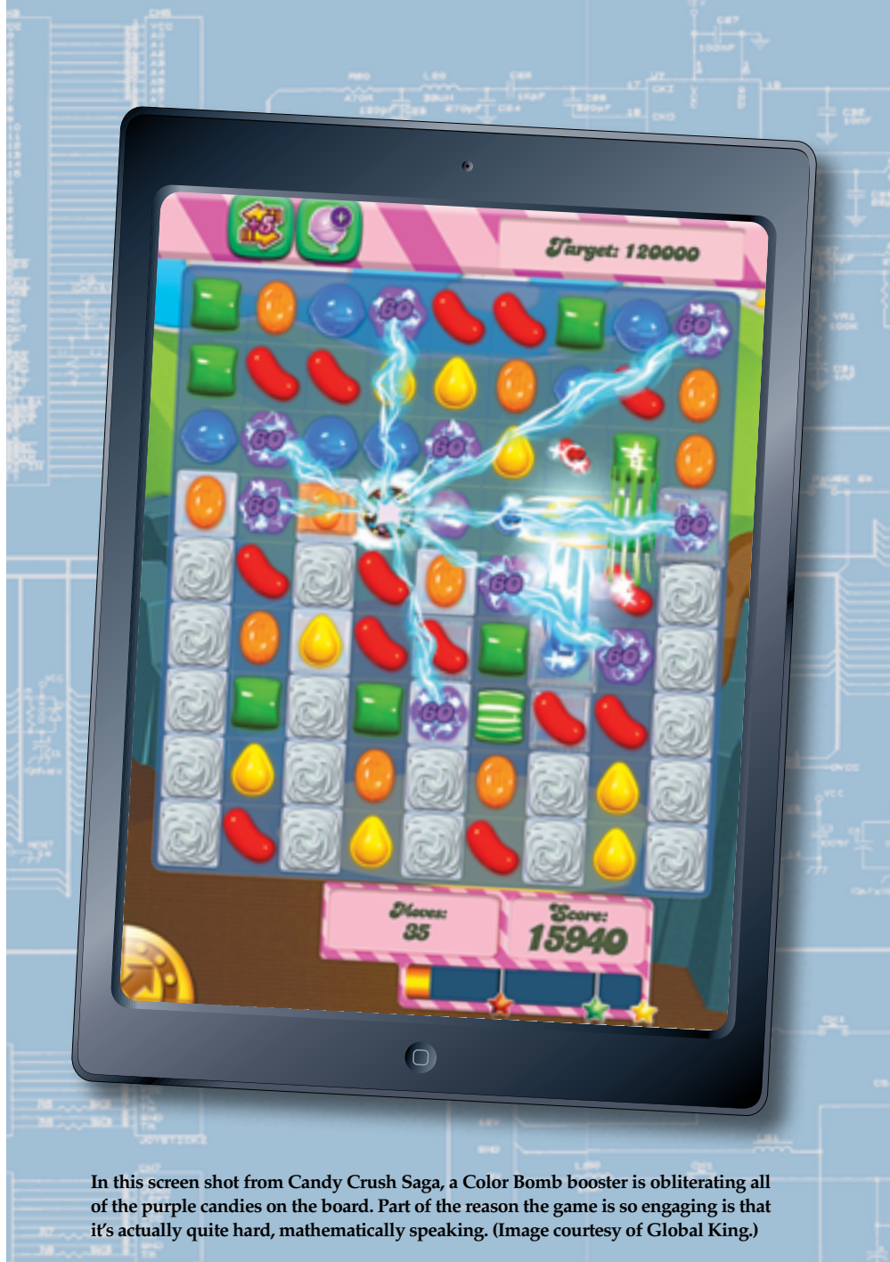
In this screen shot from Candy Crush Saga, a Color Bomb booster is obliterating all of the purple candies on the board. Part of the reason the game is so engaging is that it's actually quite hard, mathematically speaking.

Although computer scientists widely agree with my statement that NP problems are on the boundary between easy and hard, for any specific problem there is no way to know for sure which side it lies on. The best computer programs we currently have take exponential time to solve problems in NP. But we don't know if there's some exotic algorithm out there waiting to be discovered that will solve problems in NP efficiently, in polynomial time. (Mathematicians abbreviate this question as "Does P=NP ?") In fact, this is one of the most important, famous open prob-